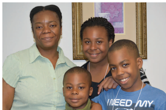
2016 Take our Daughters and Sons to Work Day®