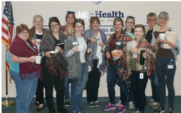
Dawn of the Debs